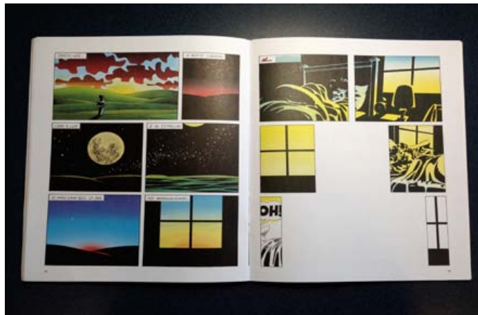
Figure 12: The Panel Boy , pages 18-19.