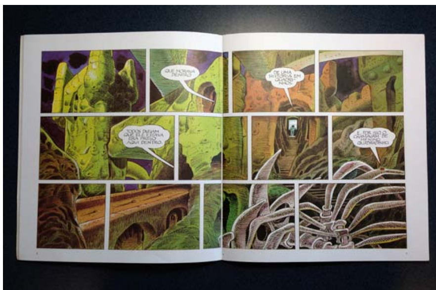
Figure 3: The Panel Boy , pages 6-7.

A final detail cannot go unnoticed in this image: at the panel positioned at the boy's chest, there is a visual and sound effect: the word "ZAP" appears over a spiky and colourful bubble. These effects seem to suggest the appearance of the boy in the story, as if a magic or special introduction. The positioning of this effect is again dubious, it could be an illustration in the boy's shirt, which can indicate his appreciation for comics, or it can be a narrative feature enhancing his entrance in the story, therefore creating ambiguity between what is represented and how it is represented, or the story and the discourse.