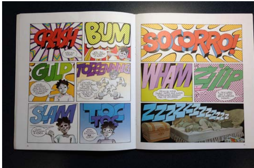
Figure 5: The Panel Boy , pages 10-11.

a further softening of the boundaries between fiction and reader, but the reader is, here, left to decide.