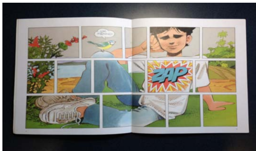
Figure 1: The Panel Boy , pages 4-5.

On the first page of the story, the images are presented in panels, as a comic, but the story starts with “Once upon a time...” 1 , said on the first panel by a bird passing far in the sky. While fairy tales are in the literary genre level and comics in the book genre, typically fairy tales are presented in picturebook form, therefore a fairy tale comic book breaks reader’s expectations, generating unfamiliarity and a subtle suggestion for readers to reflect on the nature of the narrative. The images, however, don’t show typical fairy-tale elements, except perhaps for the fact they invoke childhood; a kite, a dog, a soccer ball, a skate and dirty sneakers suggest the universe of a child, most probably a boy (in Brazil, kites, skates, and soccer balls are usually considered boys’ toys). The elements are very concrete and don’t make any reference to a magic or fantastic world, except, perhaps, for the presence of a talking bird as narrator.