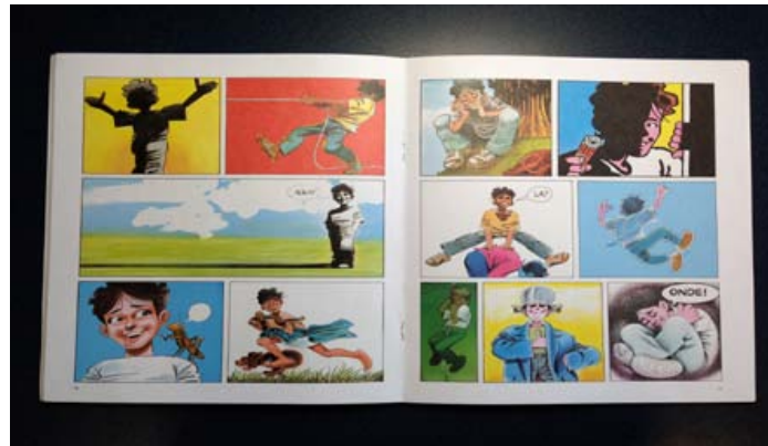
Figure 11: The Panel Boy , pages 16-17.

to have outlined many of the features of postmodernism that are still in vogue nowadays (Doris, 2014). Lichtenstein questioned the relationship between fine and commercial arts by bringing images from comics to the walls of art galleries. By expanding small frames into large-size paintings, he explored the Ben-Dey dots, typical of the printing process of comics, on the faces of comics' sexy nymphs. Ziraldo contributes to this conversation by doing the inverse movement, and bringing the aesthetics now attributed to this of fine art movement back to the comic book.