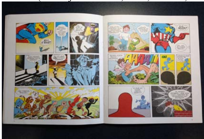
Figure 6: The Panel Boy , pages 12-13.

context, often in subtle ways” (Desang 42). When these allusions refer to a visual text, such as a piece of visual art or the visual aspect of a multimodal text, the term intervisuality is often used (Nikolajeva & Scott, 2001; Serafini, 2016).