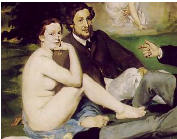
Figure 2: Detail of Edouard Manet's Le Déjeuner sur l'Herbe (Luncheon on the Grass)

little bird. In this scene, the protagonist is introduced and his relationship with the reader starts to be forged. The image portrays a boy, seated on the grass, surrounded by nature (flowers, trees, a lake in the background), his body covering most of the spread. The comics' panel structure continues, but instead of each image portraying a scene of the story, they all form the pieces of a mosaic that constitutes the portrait of the boy, merging the comic book format with the full-page illustration typical of picturebooks. McCloud (1994), building on the terminology by Eisner (1985), defines comics for the sequential nature of its images. While the presence of several panels in one spread reinforces the characterization of this text as a comic, the lack of temporal relationship between the panels challenge it. According to McCallum (2008), "the white space is the liminal space between fiction and reality" (190), so the gutter constitutes a barrier between the world of the reader and that of the character. The boy is imprisoned by the white "bars" and forced to stay in the universe of fiction.