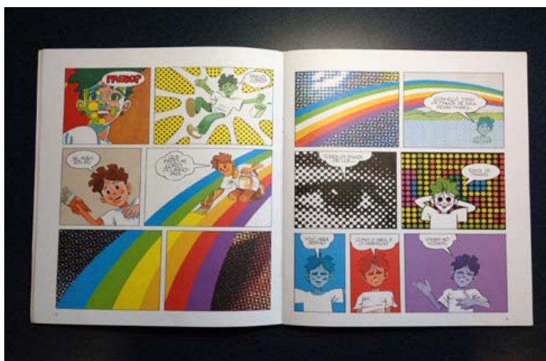
Figure 4: The Panel Boy , pages 8-9.

and on the linguistic level, as the representation of Ben-Dey dots, exhibiting the micro drops of ink as much bigger dotted patterns that superpose, make the printing process explicit.