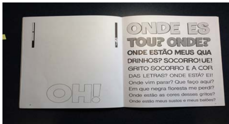
Figure 13: The Panel Boy , pages 20-21.

The introduction of intertextual references of works of children’s literature where the verbal narrative is dominant starts a process of transition from the comic universe to the prose universe. This process will be represented visually by the shrinking of the panels and the increase of the gutter space (18-19). On the next spread, there is almost nothing left of the comic world and the verbal