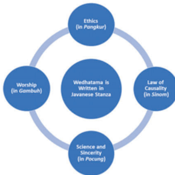
Figure 1. Etymologically, Wedhatama is originated from the words wedha and tama . Wedha means knowledge and tama means main goodness. It contains 5 basic principles about the existence of God, human relationship, knight soul ( jiwa ksatria ), respect for other, and struggle of life teachings. The manuscript is written in the form of Javanese stanza (Javanese poetic rhythm), which is divided into 4 forms of stanza: namely Pangkur (7 lines), Sinom (9 lines), Pocung (4 lines), and Gambuh (5 lines).

Sembah Jiwa (soul worship), as a third worship written in the manuscript, aims to understand identity as a human being. Sembah Jiwa is truly dedicated toward