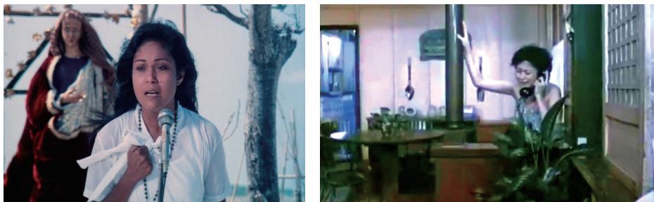
Figure 5. Climactic scenes of Himala and Relasyon : left, Elsa (Nora Aunor) confesses to her followers that her pregnancy resulted from rape rather than immaculate conception, affirming that supernatural miracles are fraudulent, before a bullet from an anonymous shooter kills her; right,