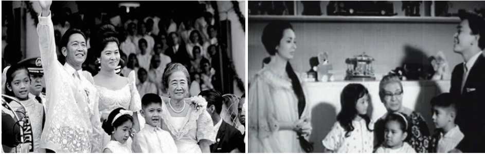
Figure 2. The Marcos family during their inauguration (left) and as depicted in the campaign flick Iginuhit ng Tadhana (right). Although Imee became an active theater presence at the national university and was considered by Lino Brocka to star in his first Cannes filmfest entry Insiang (1976), the figure common to both pictures is the actor who portrayed the Marcoses' son: Ferdinand Jr., also known as Bongbong, informally addressed as BBM and elected President in 2022.

Imelda Marcos's rise in cultural dominance in her husband's regime. 1